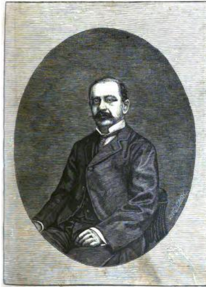
ΧΑΡΙΛΑΟΣ Σ. ΤΡΙΚΟΥΠΗΣ